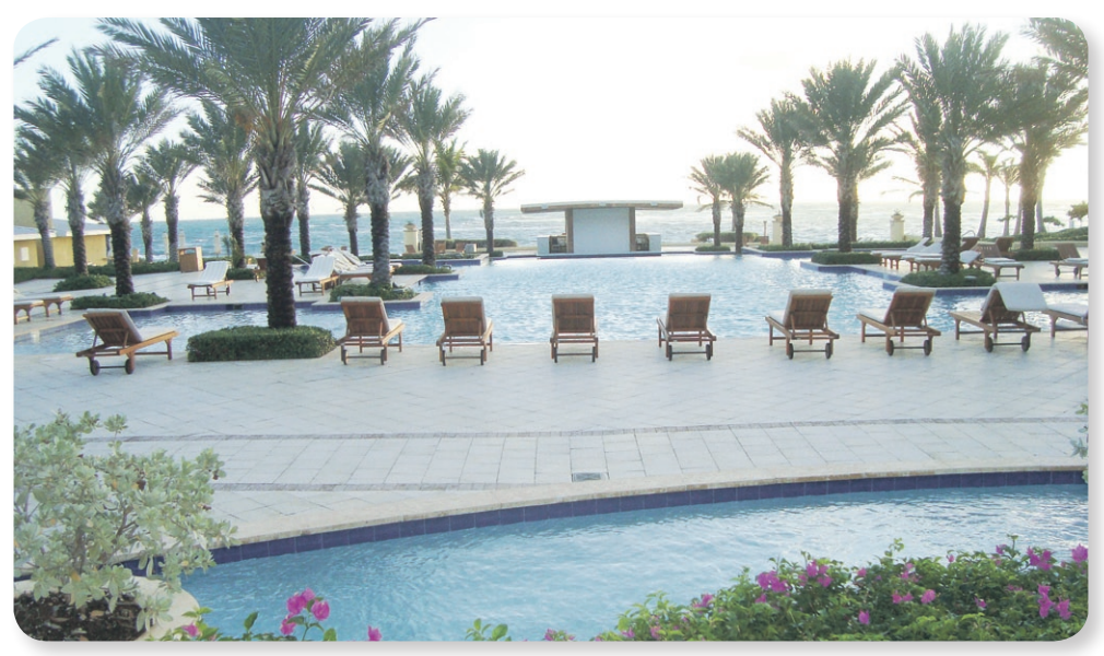
There are 37 sandy beaches on the island.